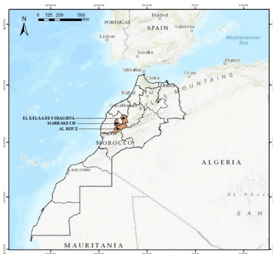
Fig. 1: Geographical Map of the Study Area