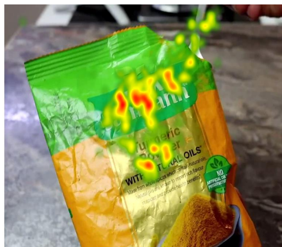
Fig. 3: Heat map in the first video

Figures 3-5 show heat maps for the three video scenarios where the product is placed at the beginning, in the middle, and toward the end of the video. The fixation zones are colored in the red-yellow-green color spectrum, with red denoting longer FD, yellow denoting medium FD, and green denoting shorter FD. As a result, dark areas in the heat maps got 90% of total fixations, as shown in Fig. 3-5. The viewers' visual attention was primarily concentrated on regions that comprised brand names and product names. In the current study, eye movement analysis was conducted to analyze viewers' visual attention in addition to participants' visual focus on the video, as shown by the heat maps. Each AoI's FD and FC were calculated and compared. The effects of the brand name and the product name on the participants' visual attention were primarily investigated. The finding reveals that most participants' visual attention was drawn to the brand name and product name in the video while watching it.