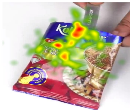
Fig. 4: Heat map in the second video