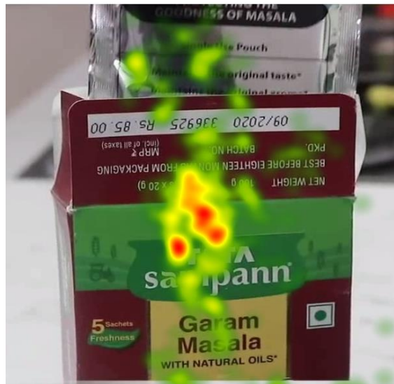
Fig. 5: Heat map in the third video