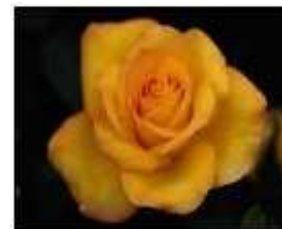
Fig. 4: The Corel_1k query "Yellow flower" from dataset