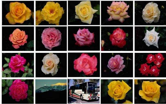
Fig. 4a: Retrieval result for the Corel_1k query #12 using DCD with GLA. 5 of 17 ground truth images found in first 20 retrievals