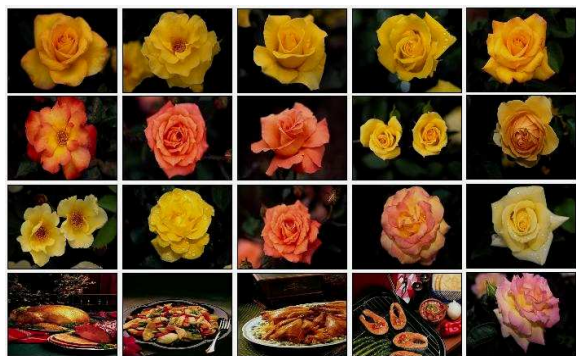
Fig. 4b: Retrieval result for the Corel_1k query #12 using DCD with FRCFE. 11 of 17 ground truth images found in first 20 retrievals