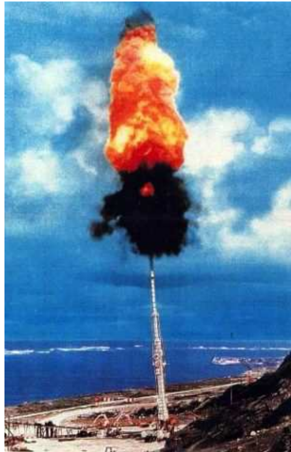
Fig. 1: HARP 16-inch (410 mm) gun in Barbados

The project is based on a flight line at Seawell Airport in Barbados at 13.077221 °N 59.475641 °W, when the shells were pulled east of the Atlantic using a 16.5 inches (415 mm) long double (20.5 m) (41 m) 1. In 1966, the third and last 16-inch cannon was installed at a new test site in Yuma, Arizona. On November 18, 1966, the Yuma pistol pulled an 84 kg Marlet 2 projectile at a speed of 2100 m/s, sending it briefly into space and setting an altitude of 180 km (110 miles), Fig. 2.