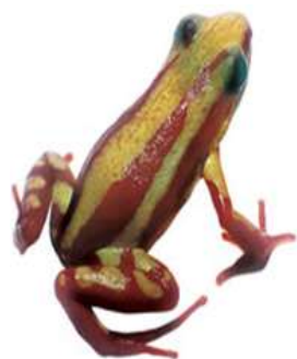
Fig 1. Epipedobates tricolor