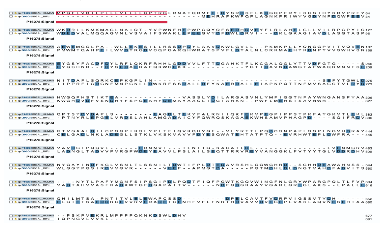
Fig. 4: Results of alignment of human beta-galactosidase (Oshima et al. , 1988. Upper line) and beta-galactosidase from Bifidobacterium longum (Hsu et al. , 2005). Aspartic acid (D) and Glutamic acid (E) are highlighted

Fig. 3: Results of alignment of human beta-galactosidase (Oshima et al. , 1988. Upper line) and beta-galactosidase from Bifidobacterium longum (Hsu et al. , 2005)