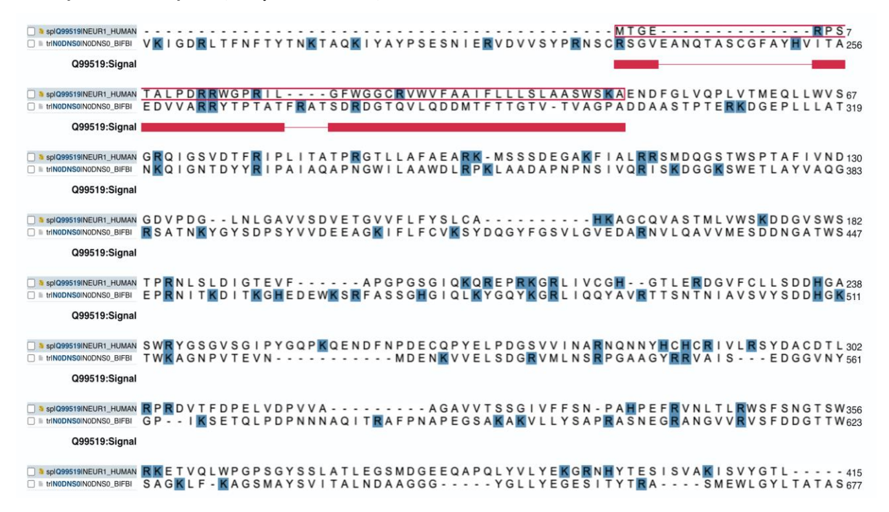
Fig. 2: Results of alignment of human sialidase (Bonten et al. , 1996. Upper line) and extracellular sialidase SiaBb1 from Bifidobacterium bifidum (Nishiyama et al. , 2018). Histidine (H); Arginine (R); and Lysine (K) are highlighted