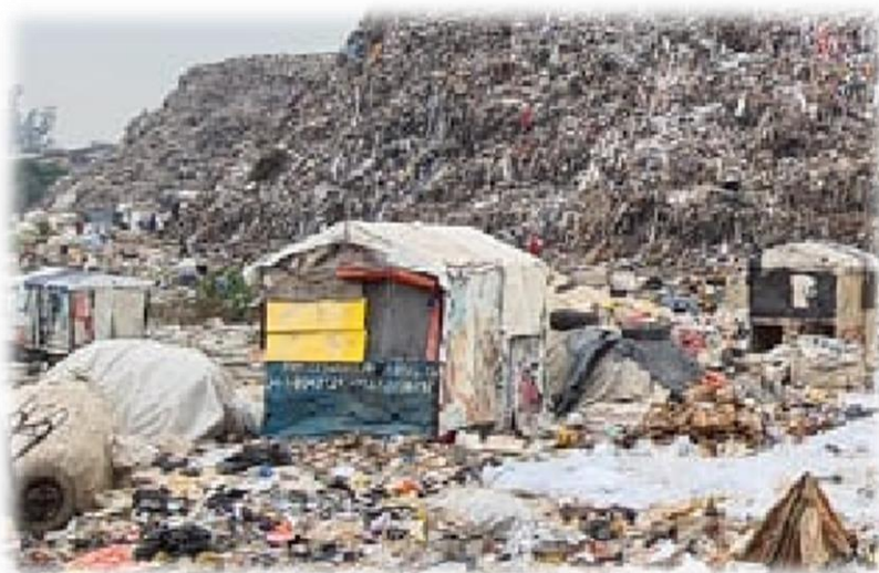
Fig. 5: A typical example of a shelter built for waste pickers on the site