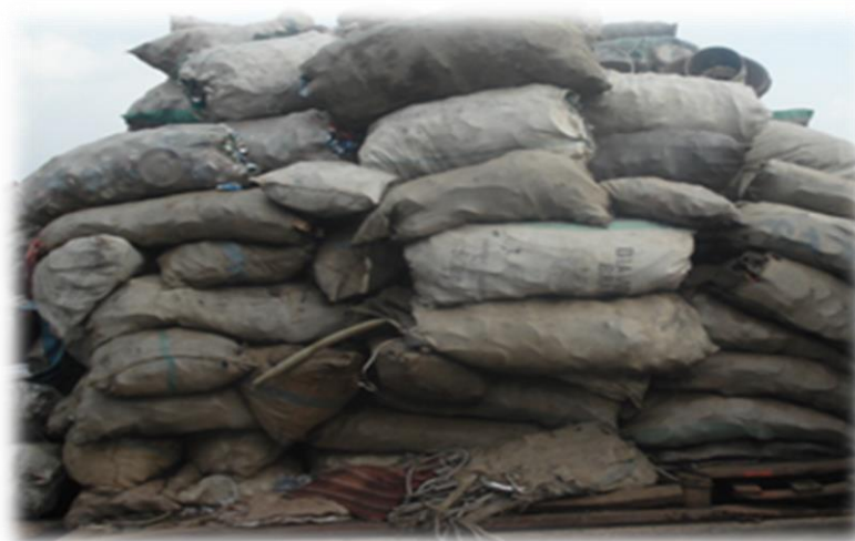
Fig. 4: Scavenged materials stored in the sack within the dumpsite, Source: Authors' Fieldwork, 2021