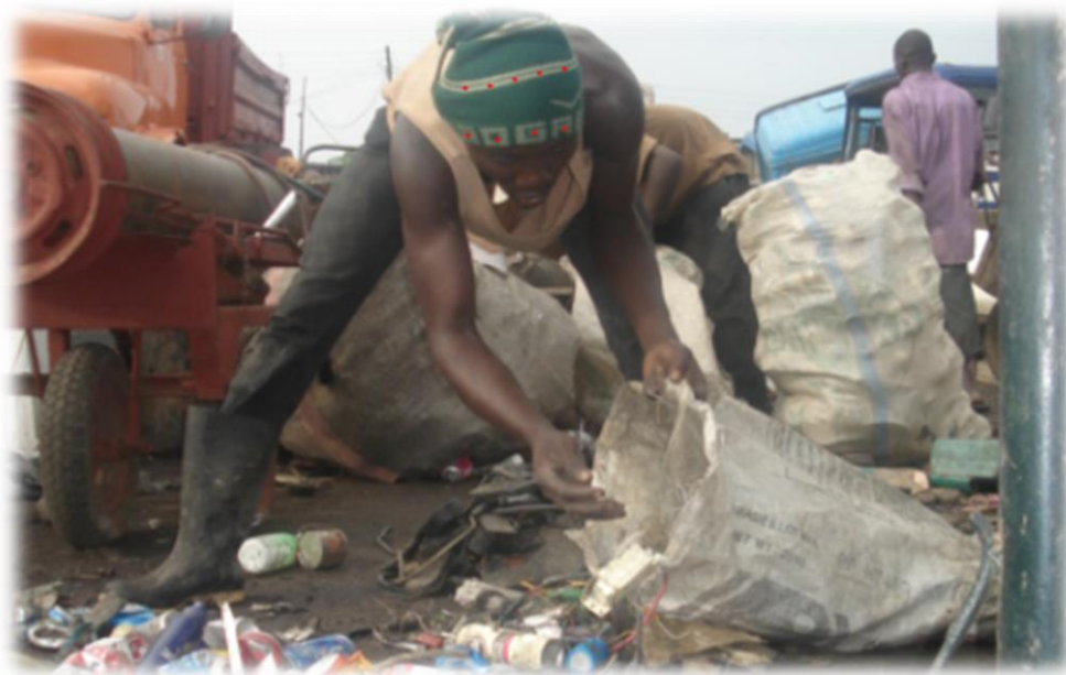
Fig. 6: A child waste picker was spotted on-site sorting waste materials with bare hands, Source: Authors' Fieldwork, 2021