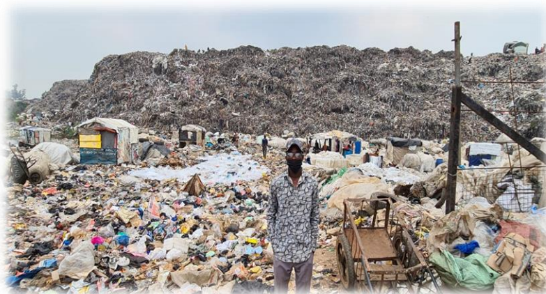
Fig. 2: An overview of Olusosun open waste dump in Lagos, Nigeria.