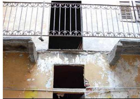
Fig. 1: The remains of a balcony in Pietra di Courtil

Almost all the standardized ageing methods used to simulate weathering on natural stones involve water, which, together with other factors, indirectly induces weathering: thermal shock (EN 14066: specimens cooling in water), freeze and thaw (EN 12371: iced water in stone pores), salt crystallization (EN12370: water carrying salt into the pores), resistance to thermal and moisture cycling (prEN 16306: the bottom of the specimen is set on a wet surface). However, the loss in mechanical strength for all these standardised ageing methodologies is evaluated using dried specimens subjected to the weathering cycles and comparing them with dried specimen in natural conditions.