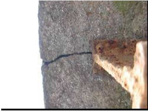
Fig. 3: Details of a Verde Argento balcony where the beam leans in correspondence to a fracture

However, the presence of water in the pores of a stone is the direct cause of loss in mechanical resistance. In a recent paper, Torok and Vászrhelyi (2010) has asserted that rocks with high porosity (such as travertine) behave in a completely different way under dry and water saturated conditions (reduction in strength with an increase in the water content). In this research the dependence of mechanical behaviour on the water content has been pointed out even for the stones with low porosity. The water in the pore softens the bonding strength (especially in the presence of phyllosilicates like micas, which are present in the three stones studied in this study).