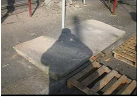
Fig. 6: The Pietra di Luserna broken balcony slab due to wrong project calculation

In case n°15 of the database (Perino, 2008), a balcony in Pietra di Luserna in which a fault occurred (Fig. 6), the maximum moment M_{MAX} of 1.68 \text{ kN m}^{-1} and the section modulus W of 0.33 \text{ m}^3 , computed from balcony measurements (length 200 cm, width 50 cm, thickness 8 cm, modillions distance 174 cm), gives \sigma_{max} (maximum flexural strength) according to Eq. 1: