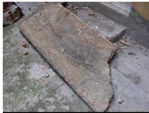
Fig. 2: The broken balcony slab of Fig. 1

Corresponding Author: Bellopede Rossana, Department of Environment, Land and Infrastructures Engineering, Politecnico di Torino, Corso Duca degli Abruzzi 24-10129 Torino, Italy