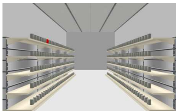
Fig. 1. Image showing a virtual modern store aisle with a colored item in the left gondola

To avoid perceptual bias, all the images shown were perfectly symmetrical to the vertical axis. The average item dimensions were 0.76^\circ horizontally and 1.04^\circ vertically, when seen from a distance of 55 cm. At the beginning of the experiment, a sample image was shown for 10 sec. Then, each subject was asked to stare at a central white cross on a black background (fixation cross). After 3 sec, the first image was shown for 150 msec. Then, the fixation cross re-appeared for 3 sec, followed by a new test image for 150 msec. The same procedure was repeated until completion of the experiment (Fig. 2).