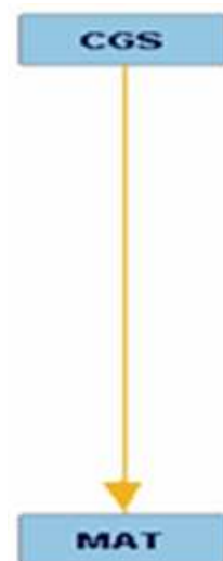
Fig. 3. Results from the directed acyclic graphs