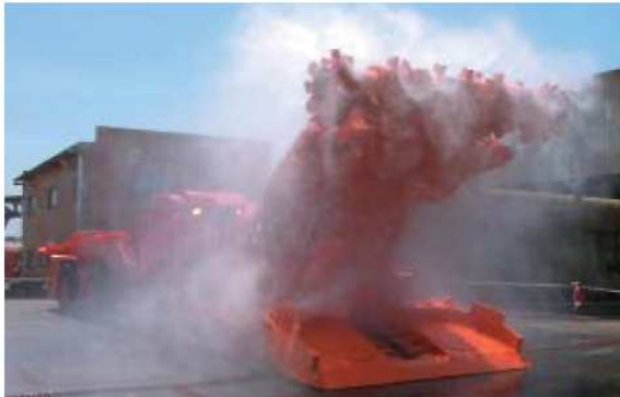
Fig. 6. Roadheader fitted with a de-dusting system used as a possible winning means in critical formations

When a full-face technique is used in the tunneling excavation, it is important to note that some types of machine, such as the hydrosshield and slurryshield, intrinsically remove the excavated materials, with a hydraulic close circuit, from the excavation chamber.