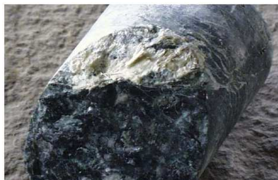
Fig. 5. Drill cores from serpentine bodies from the Western Alps

According the Authors' experience in the Italian Western Alps (Fig. 5 shows an example of a drill cores from the Western Alps) it can be stated that surface core drills, even though essential for the characterization of large scale rock formations in terms of geological and geo-mechanic aspects, cannot be considered exhaustive for an evaluation of the asbestos content. For these reasons, progressive core drillings from the tunnel face are always necessary, regardless of the surface drilling results, to obtain information at a local scale on the expected presence of asbestos along the tunnel route.