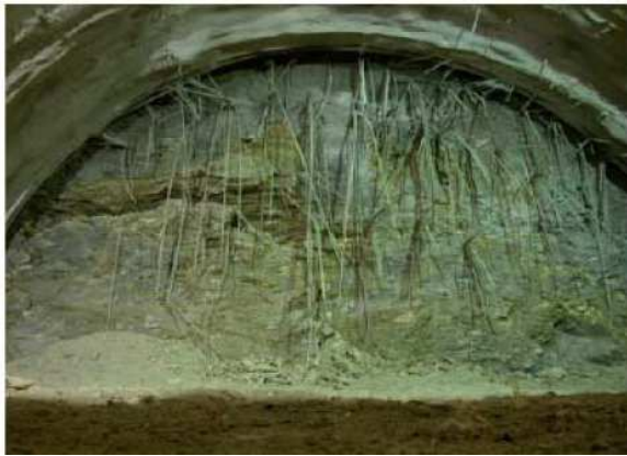
Fig. 2. Tunnel face (intensively weathered mica schists)