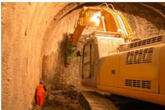
Fig. 4. High Hydraulic Energy Hammer at work while a second worker provides the machine operator with visual help and “tries” to reduce the airborne dust pollution by spraying water onto the face

This can be considered a particularly serious and double problem, since the tunneling operations obviously