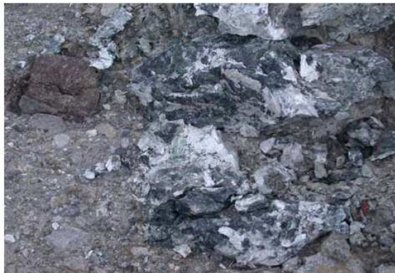
Fig. 3. Asbestos elements in the fractures of heaped muck intended for reuse