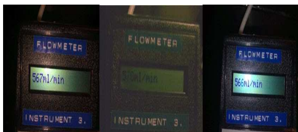
Fig. 6: Shows the measurement of flow rate of fuel through the test chamber by using the flow meter