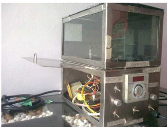
Fig. 2: Shows the test chamber