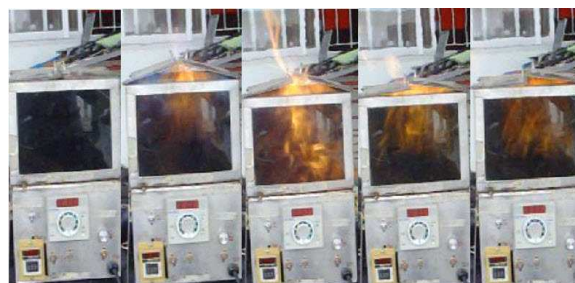
Fig. 5: Shows the test of flammability at 165 sec

The volume is 0.34 L or the fuel is 1.67% of air in the test chamber from the 3rd test. The flammability limits continue to expand until the maximum level at 180 sec in which the volume is 1.49 L or the fuel is 7.5% of air in the test chamber. The test results are shown in Table 2.