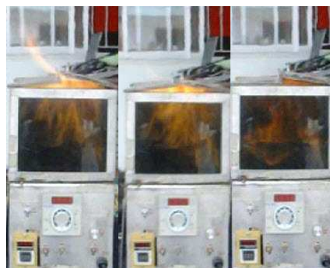
Fig. 4: Shows the test of flammability at 145 sec